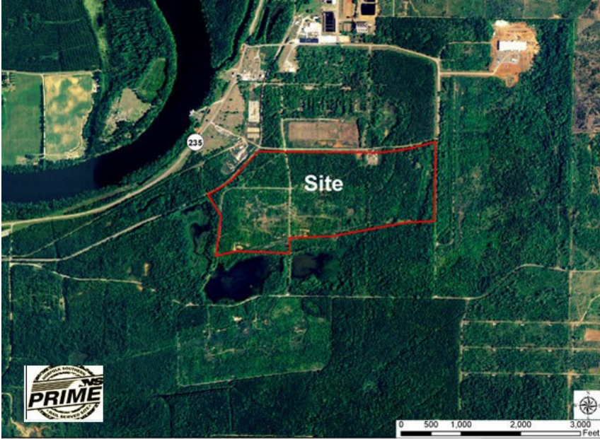
Highway 235, Childersburg, Talladega, AL, 35044